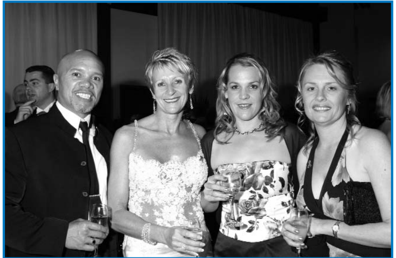
Legatees enjoying themselves at the Blue Ribbon Dinner