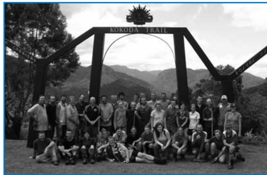
Kokoda participants 2007.

There were definitely some great friendships formed throughout the trip as we all worked together to get everyone through. And so, around midday on April 24th we reached the end at Owers Corner. The tears flowed freely as we realised it was over. We had all made it to the end of an unforgettable journey stretching 96 kilometres. After having time to reflect and look back through the mountain ranges one last time, we were driven to our hotel in Port Moresby for some well deserved relaxation and much needed refreshing.